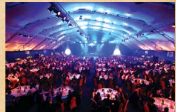
The Times Square Convention Centre

This will be a competition with a difference as we are offering Britain's youth the opportunity to compete in four fantastic disciplines, Karate, Taekwondo, Brazilian Jiu-Jitsu and Freestyle right in the heart of the magical Disneyland Resort Paris. The tournaments will take place in the Times Square Conference Centre situated in the amazing surroundings of Disney's Hotel New York® and will be uniquely branded with EFMA Disney certificates, medals and character appearances to ensure that the European Junior Tournament Series is a unforgettable and magical experience for all the young competitors.